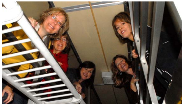
Several passengers try the Music City Star for the first time during the trial Lakewood run in early October.